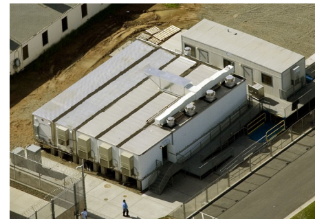
Temporary Kitchen Facility provided by: Kitchen Corps, Inc.

Each quarter the Kitchen Corps, Inc. design team chooses a past or present project to be featured. We hope that this will give you some insight to the different tasks and challenges that we are faced with and how we come to resolutions in order to assist in any project-large or small. Hopefully, your project will be next.